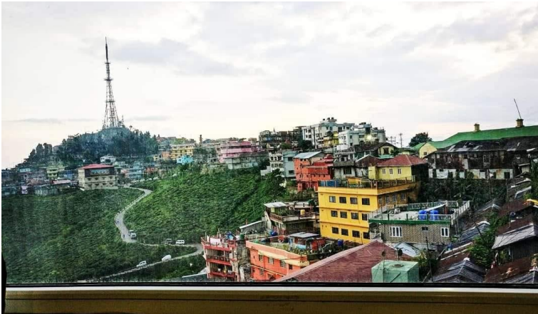
A view of Kurseong's landscape

Its lush, verdant green landscapes occupy a several hectares across the undulating terrain of Darjeeling. The actual tea plantation is segregated into 3 divisions and they have a work force of around 700 people between these divisions.