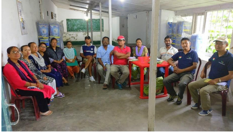
The FTP committee