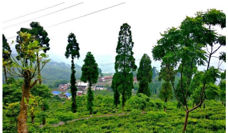
Singell Tea Estate

Singell Tea Estate is a part of the wide profile of Tea Promoters India, an organic tea growing and packing company. They have several tea estates in Darjeeling, Assam and also South India. The company has a long standing commitment to organic and bio dynamic methods of growing and they place a great emphasis on maintaining the ecological balance and protection of the environment. Their tea workers and small farmers all belong to local communities and are keenly tuned to guarding their ecosystem through ethical practices of farming. Singell Tea Estate is under the umbrella of TPI and follows all the principles and ideals of its parent company.