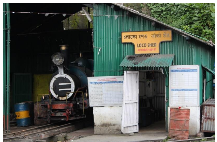
Locomotive shed of the DHR