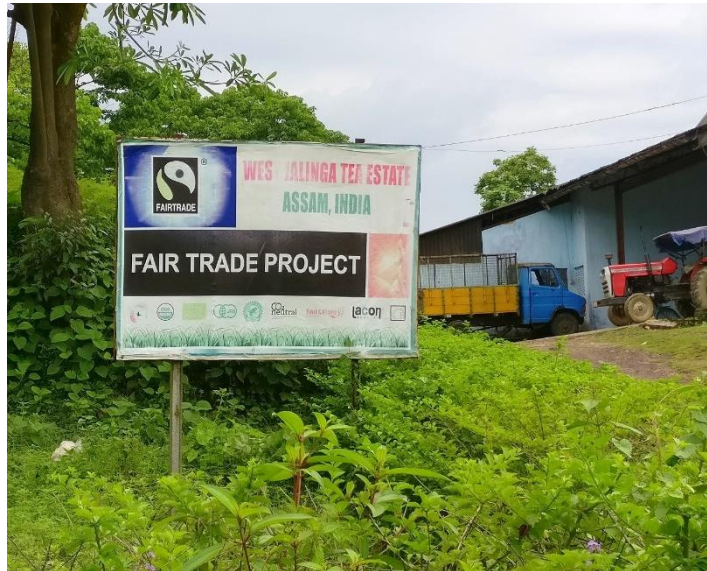
Fairtrade premium at West Jalinga Tea Estate

The FPC at Jalinga consists of a total of 19 members, 1 from the management + 2 staff + 2 sub-staff + 14 workers.