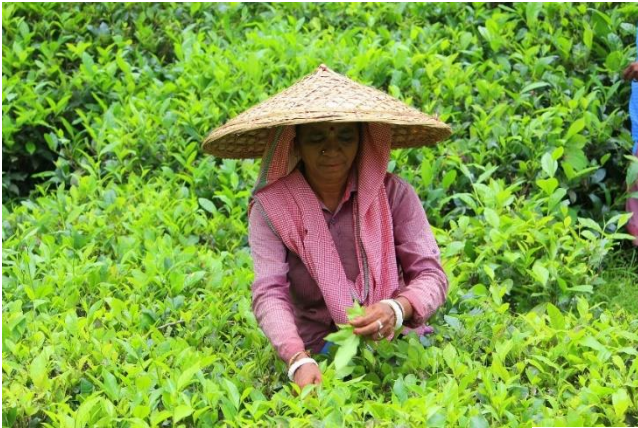
Workers in the tea estate