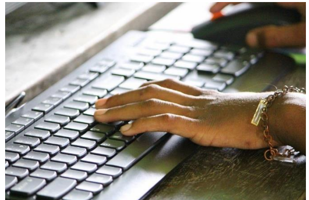
School children using the computer