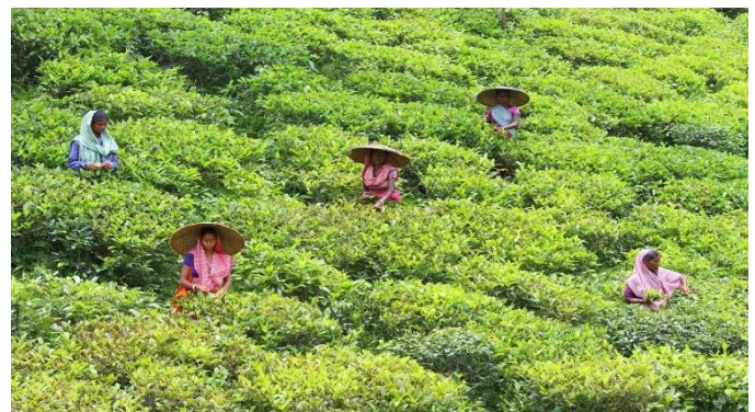
Workers in the tea estate

They have a work force of 1365 people between their 3 divisions of Jalinga, Kalachera and Dwarbund.