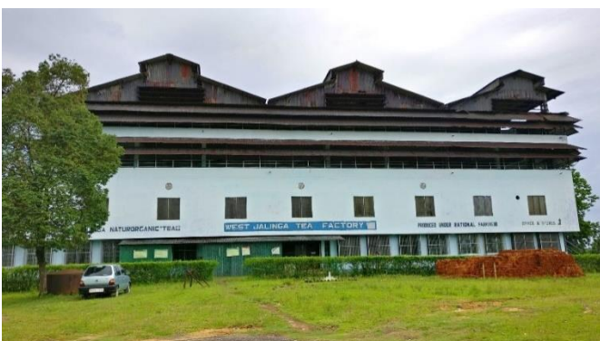
West Jalinga Tea Factory

Of even greater significance is that it is the only CO2 Neutral certified tea estate in the world.