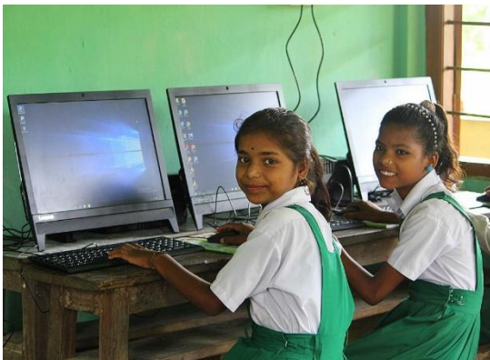
School children using the computer