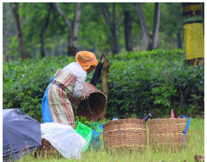
Tea Worker at Borengajuli