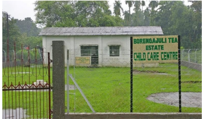
Proposed site for the second children's park