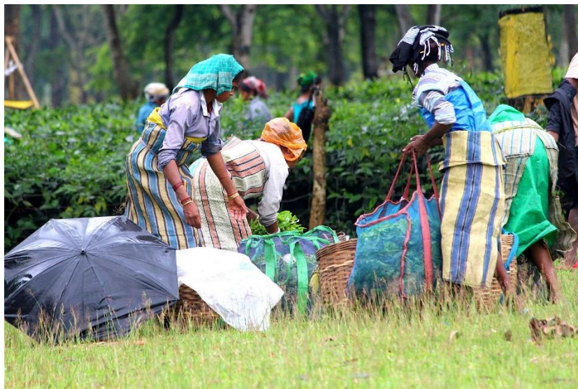
Tea Workers at Borengajuli

The estate is located in the Dimakuchi village of the district of Udalguri in the northern part of Assam in India. It is situated at a distance of 90 km from Guwahati which is the nearest international airport. The drive takes around 2.5 hours and the road is tricky during the rains. The recent construction of a bridge has now made it much easier to reach the estate. Earlier, vehicles had to drive across a river bed to get there and the estate used to be cut off when the river was full.