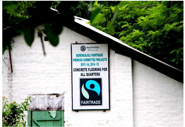
Concrete flooring project