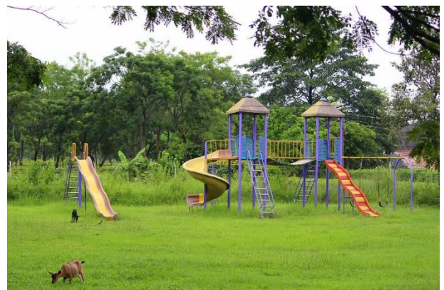
Playground equipment at the Bamanjuli LP school

The set up of a second Children’s park is an ongoing project that is being implemented to improve the existing facility for children. The first park that was built, is at the Lower Primary school in the Bamanjuli division.