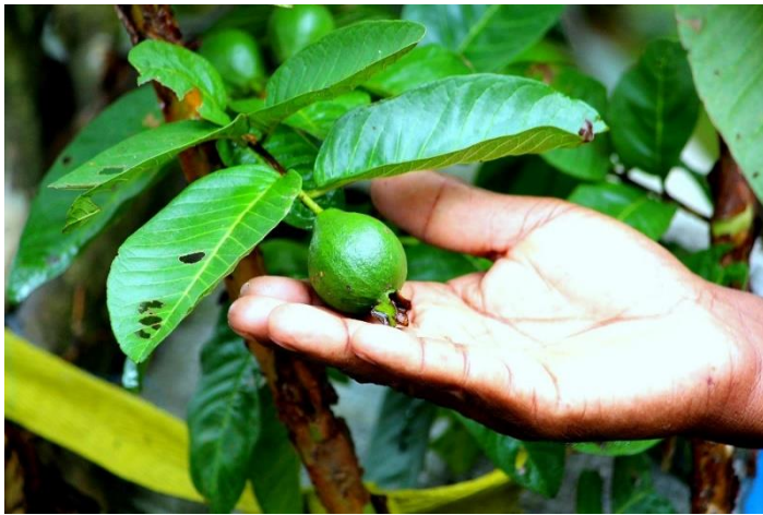
The first crop of guavas in Pitar's garden

Fruit tree plantations: To promote sustainability and a pride in growing one's own produce, Fairtrade Premium funds have been utilised to plant fruit trees in the gardens of worker and staff homes. This has also instilled in them a sense of responsibility for the environment and since it makes use of the existing space within their own gardens, they feel a sense of satisfaction and fruitfulness when they literally enjoy the fruits of their labor.