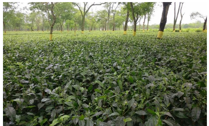
Figure 1. Borengajuli Tea Estate

eight tea estates in the Assam Valley and five in the Dooars region of West Bengal, three factories in Vietnam, six estates in Uganda and the management control of the world renowned Gisovu estate in Rwanda, Africa. Their widespread plantations, meticulous processes, art and science of blending, sustainable environmental practices and community initiatives have enabled them to strengthen their leadership in the global tea industry. Every year, the estates produce more than 100 million kilograms of quality black tea which reaches millions of tea lovers worldwide. MRIL has a large presence in Assam and West Bengal and also has several tea estates in other countries.