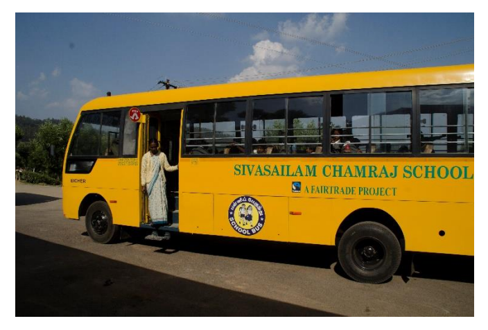
Figure 3 School buses purchased with premium money

08 Class-rooms and an Audio Visual Facility Room with a total area of 7650 Sqft have been added where english communication, public speaking and life skills are taught with NIIT softwares, which gives an edge to the twelfth standard students who are about to leave the school and enroll into colleges for their graduation. Prior to the setup, students from Nilgiris would find it difficult to compete with students from elite schools in the cities, who had greater exposure which eventually makes them confident.