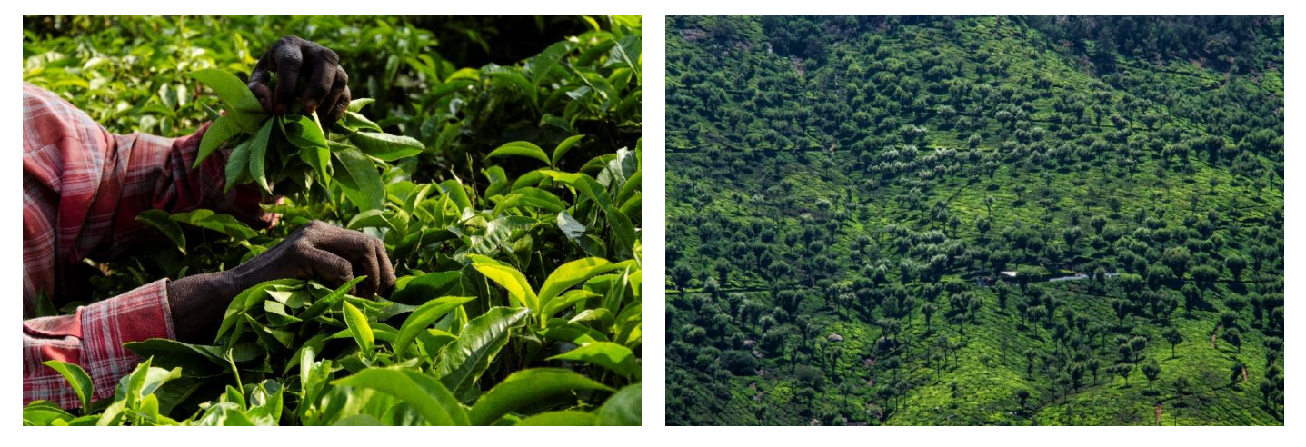
Figure 1View of Chamraj Tea Plantation

The aroma from the processing tea leaves scatter around the picturesque Nilgiri slopes to inform you that you have arrived at the destination, the withering lavender verbena welcomes you with charm to the Chamraj Tea Plantation. Tea estates in India are legally obliged to provide basic primary education, healthcare, housing, and other welfare facilities to their workforce. The Fairtrade premium has funded many projects that have brought real benefits to the workers and their communities: Some of the current on-going projects are: Education, Health care & Housing.