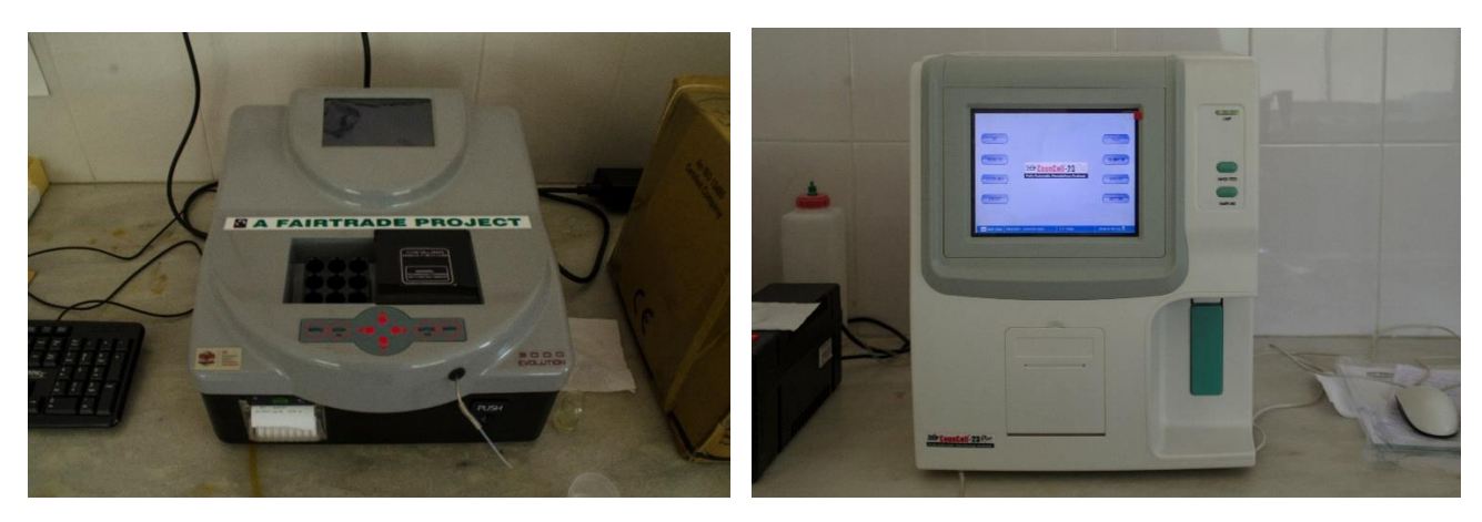
Figure 4 Semi-auto biochemistry analyser and a haematology analyser

A brand-new dental unit, semi-auto biochemistry analyser and a haematology analyser used for various blood and other medical tests were brought from the Fairtrade Premium fund. These saves time and energy for the workers who otherwise need to travel all the way to Ooty (main town) for their laboratory tests.