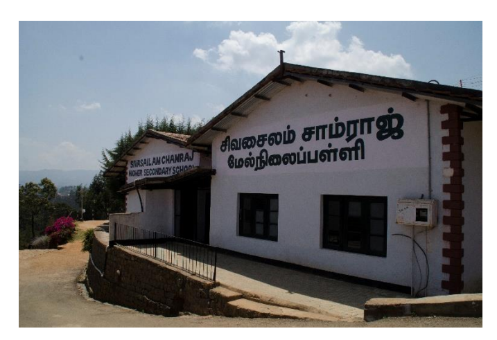
Figure 2 Chamraj Higher Secondary School