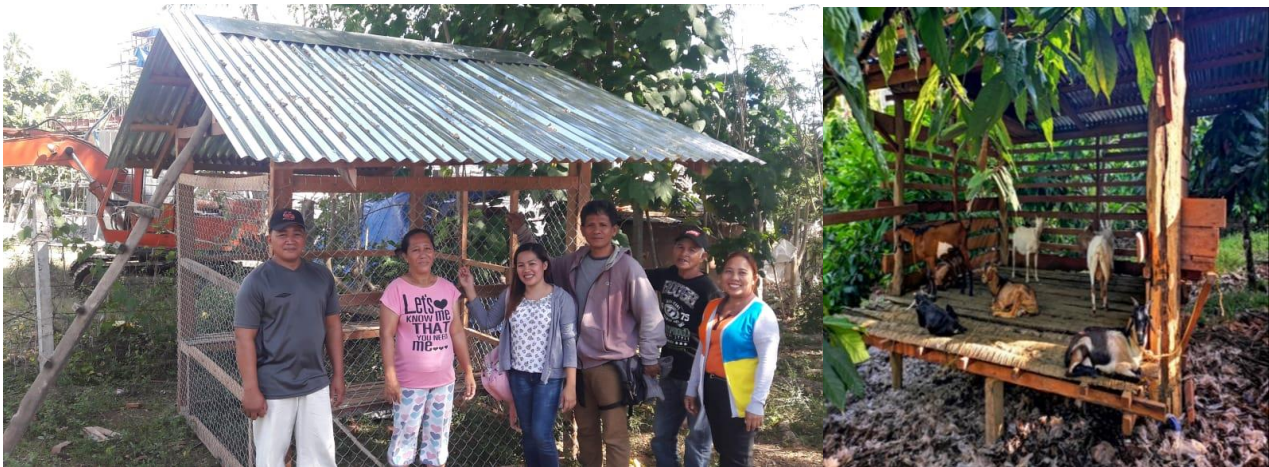
Figure 1 Fairtrade Premium Project: Distribution of Goats & construction of goat house

Though coconut production was the principle source of income for the farmers, they lacked a regular source of income to support them throughout the year. Animal farming is largely pursued in the region as complementary or supplementary activity with small ruminants having higher survival rates under drought conditions compared to large ruminants. Therefore, goat rearing was a viable supplementary source of income in the region during lean seasons and practiced mainly by resource-poor families.