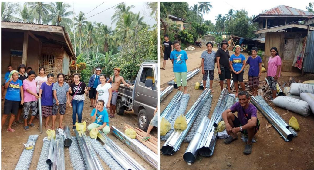
Figure 2 Distribution on materials to construct Goathouse

A better income means more money to buy food and the ability to invest in generating other food sources, such as growing new crops. This gives farmers more control over their lives when times are hard, worry less about how they will feed their families and be able to provide enough food for the people they care about, all year round.