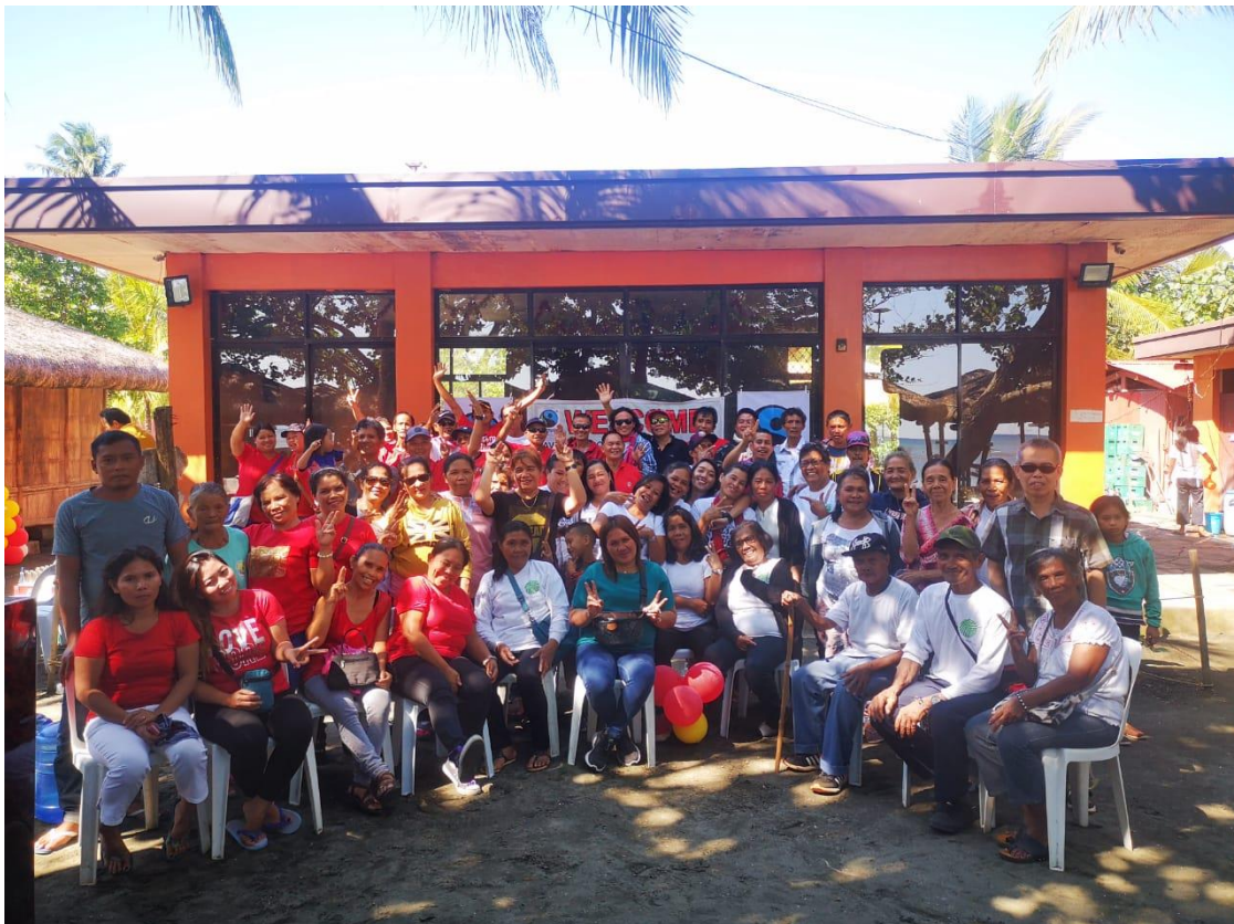
Figure 1 General Assembly 2020- Davnor Association of Farmers

DAVNOR COCO Farmers Association was founded in March 2017 and got Fairtrade certified in August 2018 with an aim to improve democracy within the SPO, build better livelihoods, improve standard of living and income of poorest coconut farmers, guaranteed minimum price, better prices & Fairtrade Premium. It is composed of 83 members, 41 are female, from three different municipalities: Tagum, Malita and Sta. Cruz.