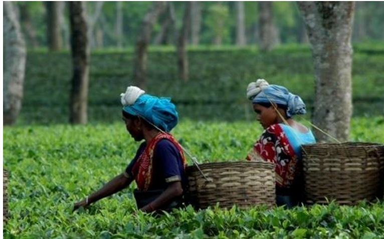
Women plucking tea leaves at the Estate

In a country that is the second largest tea-growing region in the world, Parry Agro has estates across the best tea regions in India. In South India, our estates are spread across Sheikalmudi, Murugalli, Paralai and Iyerpadi, in the Anamallai Hills; Attikunna and Carolyn, in the Nilgiris–Wayanad region; and in Assam, at Deckiajuli and Sirajuli, along the banks of the river Brahmaputra. These estates produce some of the finest Indian teas.